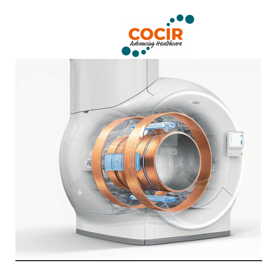
Figure 1. MRI with new magnet containing only 7 litres of liquid helium, shown in pale blue.